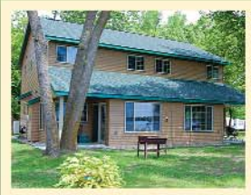
Eagle's Nest & Robin's View