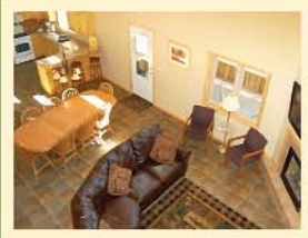
Wren's Den Overview